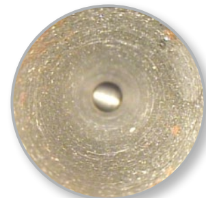
Deposits in pipe