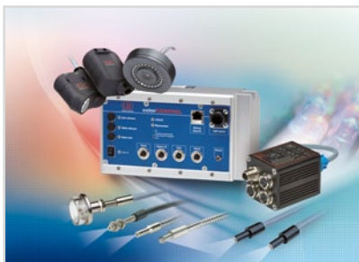
Color recognition sensors, LED Analyzers and inline color spectrometers