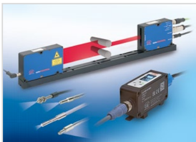
Optical micrometers, fiber optics, measuring and test amplifiers