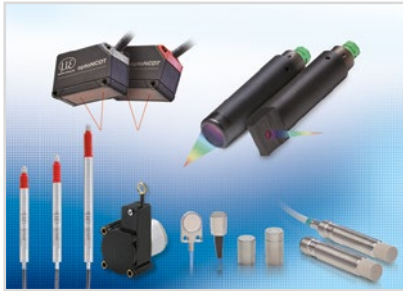
Sensors and systems for displacement, position and dimension