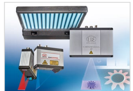
3D measurement technology for dimensional testing and surface inspection