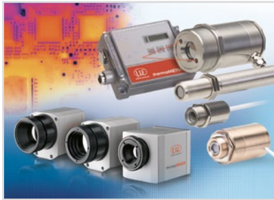
Sensors and measurement devices for non-contact temperature measurement