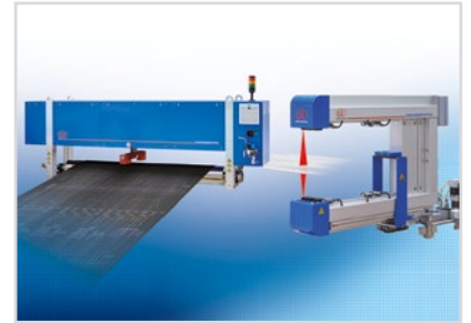
Measuring and inspection systems for quality assurance